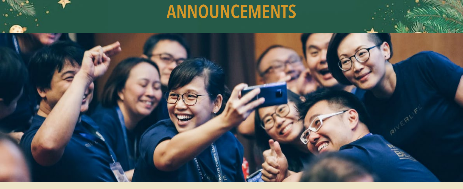
Digital Bulletin: rlc.sg/bulletin